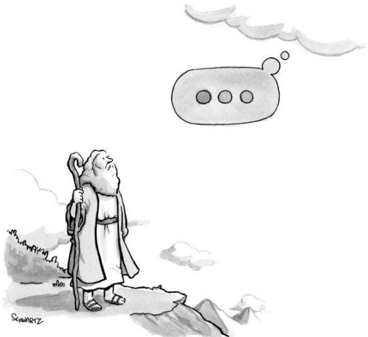
MOSES AWAITS THE WORD OF GOD

There will be an honesty box next to the Bibles at the back of church.