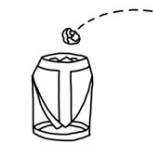
WASTE PAPER BASKET